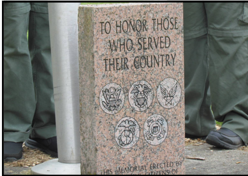
Oak Hill Cemetery Marker